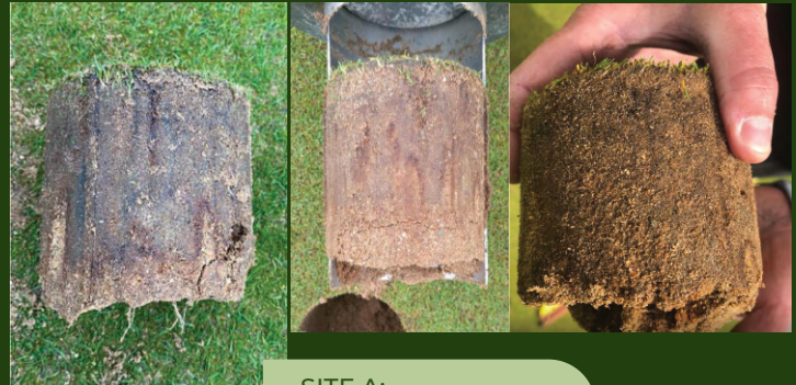
SITE A: Before (left), 6 weeks (middle) and 3 months after (right)