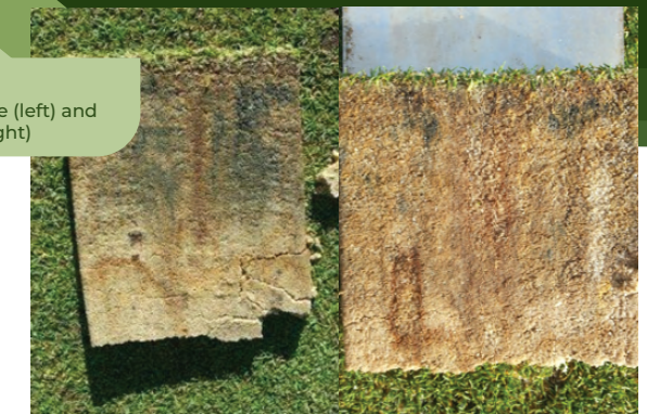
SITE B: Root length before (left) and 2 months after (right)